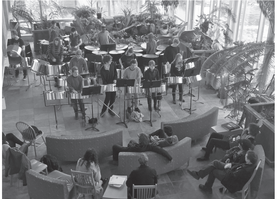
O-STEEL performs at the AJLC Open House during the 2016 Ecolympics.

team tapped seven sugar maples across Tappan Square and made almost three gallons of syrup! The AJLC then opened its doors to the community for another successful spring open house; all were invited for tours, music, sap tasting, and many other fun activities.