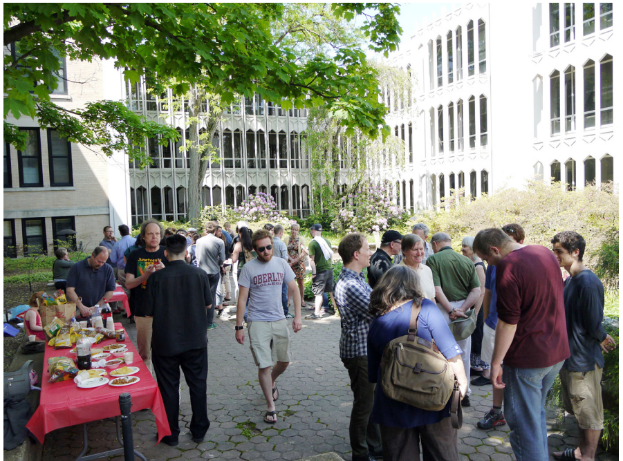
Each year, we gather in the King-Rice courtyard and say goodbye to our graduates, meet their families, and reconnect with alumni. See page 5 for more photos from Commencement/Reunion Weekend.