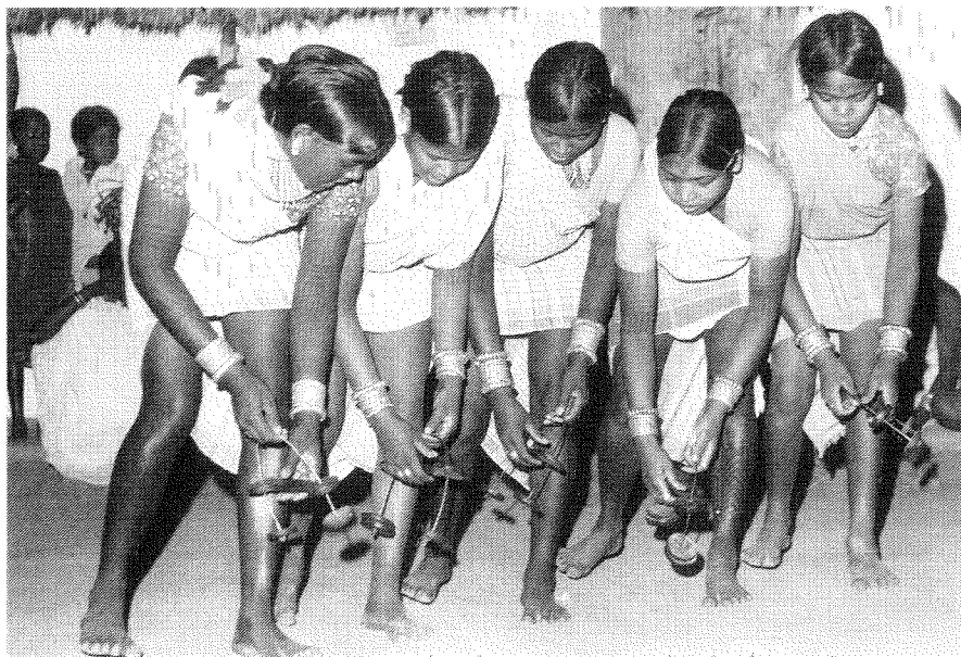
The dancers bent deeply at the waist, pulling the handle of the 'thiski' in time with their footsteps. ...

The drummers also danced as they played, tossing their drums out in front of them as they moved about. This was the Karma dance, performed on virtually all festive occasions but also simply for enjoyment at any time. The troupe performed several other dances, ending with a marriage dance accompanied by a pair of nagara kettle drums instead of the mandar . For the next to last item, the singers performed several dadaria , or forest songs. These are love songs typically performed at weddings. They retained the antiphonal style of the dance songs, but instead of drumming and dancing, the men sat in a tight cluster facing inwards, and the women formed a similar cluster next to the men. As they sang back and forth, the