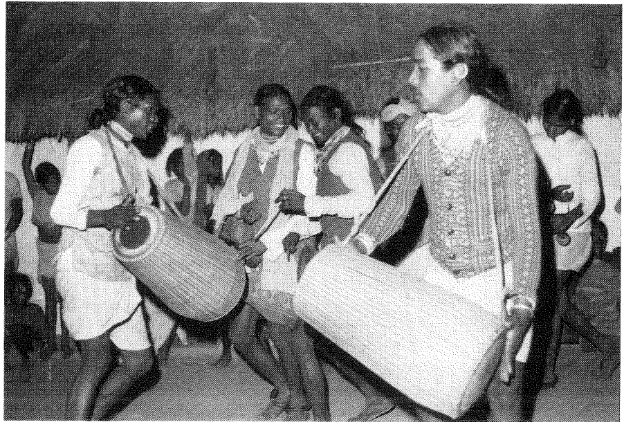
Drummers dancing the Karma dance as they play, tossing their drums out in front of them

Months earlier, in the city of Nagpur, at the exact geographical centre of the country, I had come upon Verrier Elwin's book The Baiga , written in 1939. I read with interest his detailed descriptions of the songs, drumming, and dancing of the Baiga, and was eager to learn more about them. In Delhi, for Republic Day, January 26, in 1982, I saw a Baiga dance troupe perform. I was fascinated by the combi-