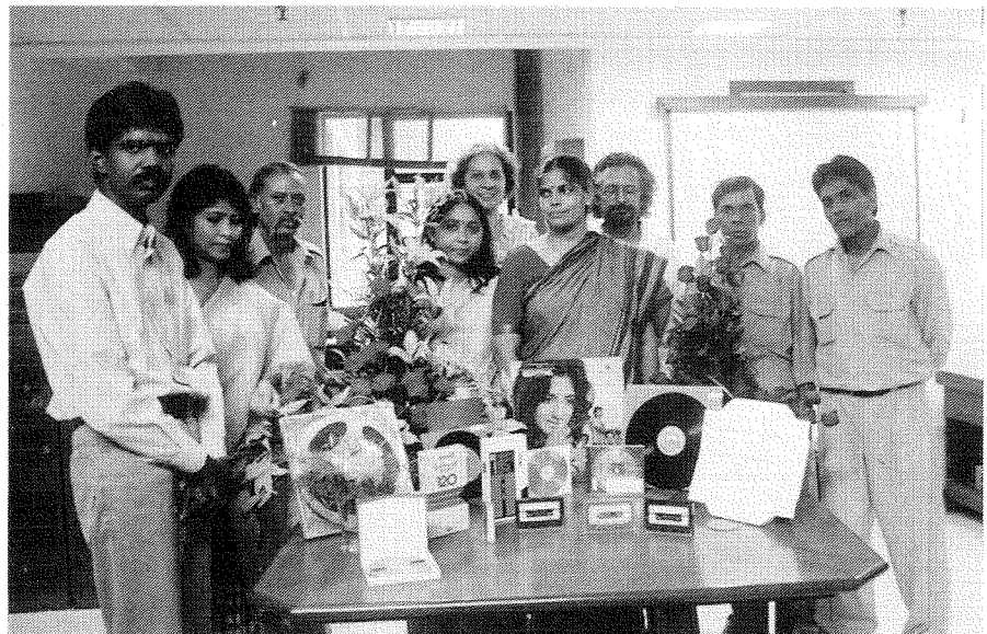
On the 1st of September this year, ARCE completed 20 years. It was a time to celebrate and reflect, and the staff at ARCE did just that. ARCE staff with the first recordings received at their archive.